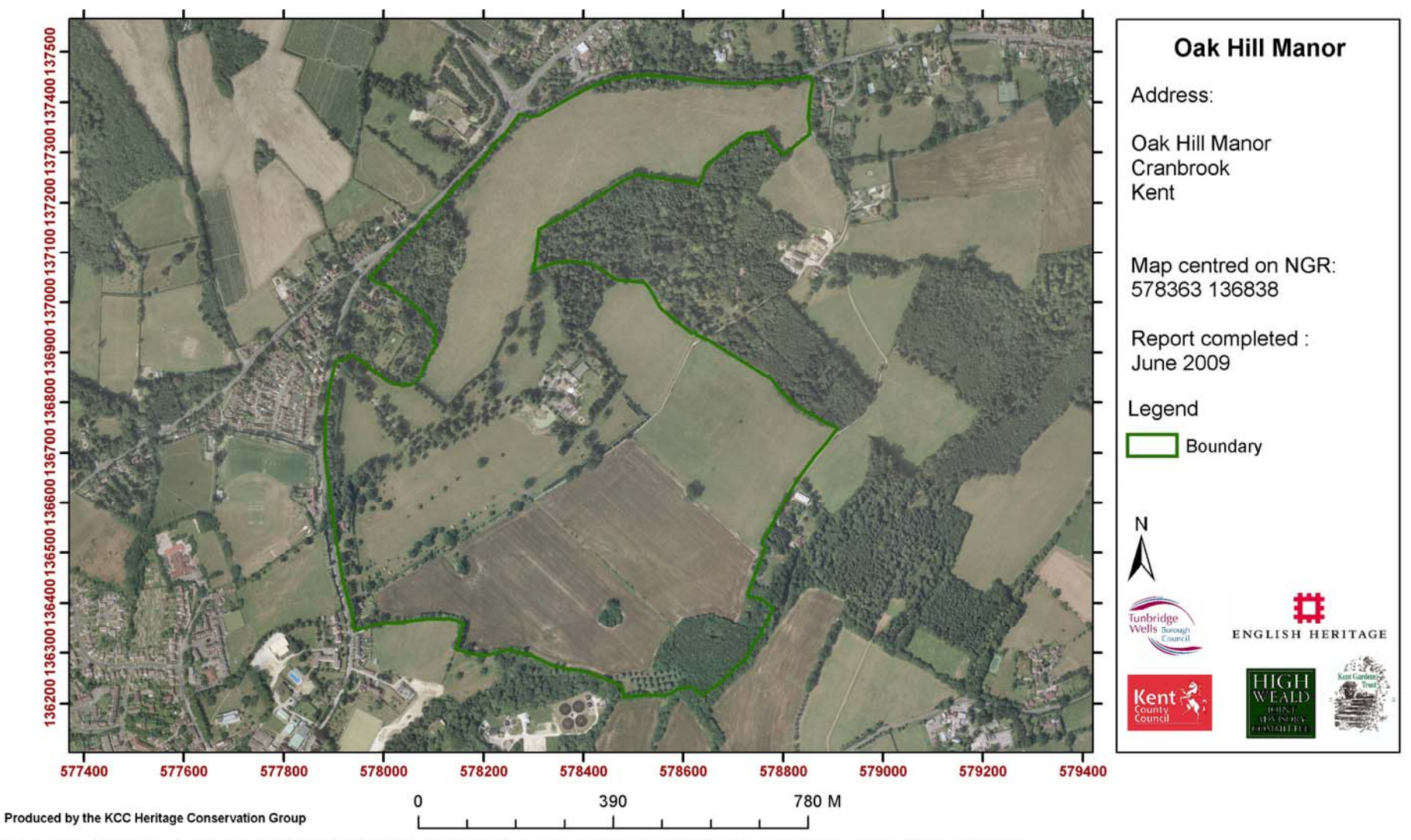
Fig. 3 Aerial photograph

This map is based upon Ordnance Survey material with the permission of Ordnance Survey on behalf of the Controller of Her Majesty's Stationery Office (C) Crown Copyright. Unauthorised reproduction infringes Crown Copyright and may lead to prosecution or civil proceedings. 100019238. 2007