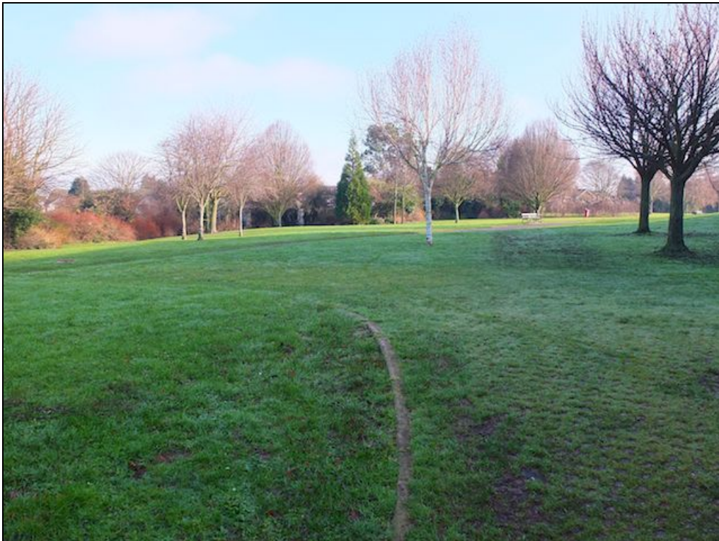
Fig.2 Selection of photographs, 2015.