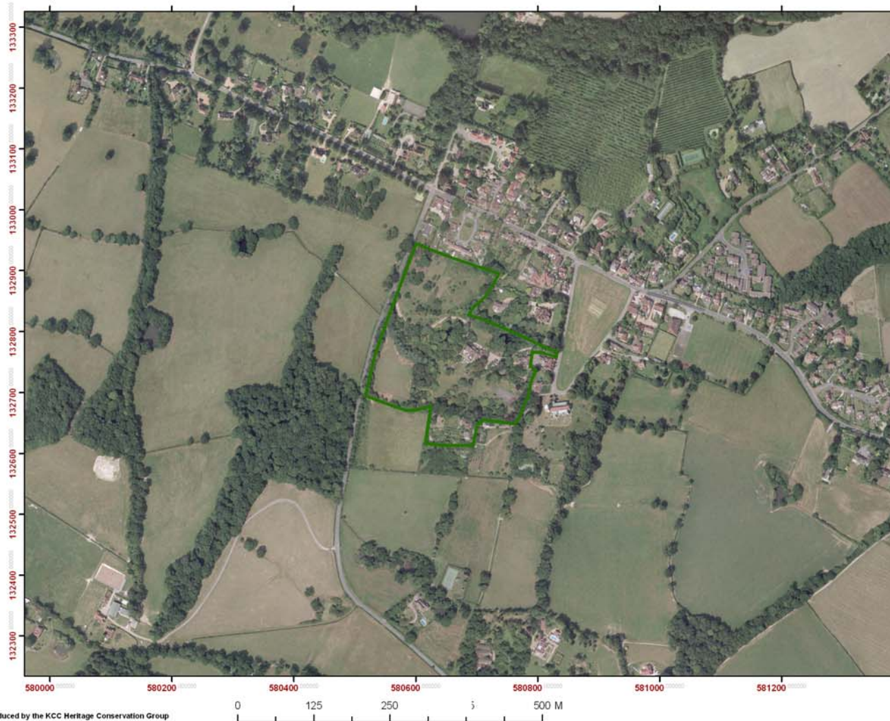
Fig. 3 Aerial photograph