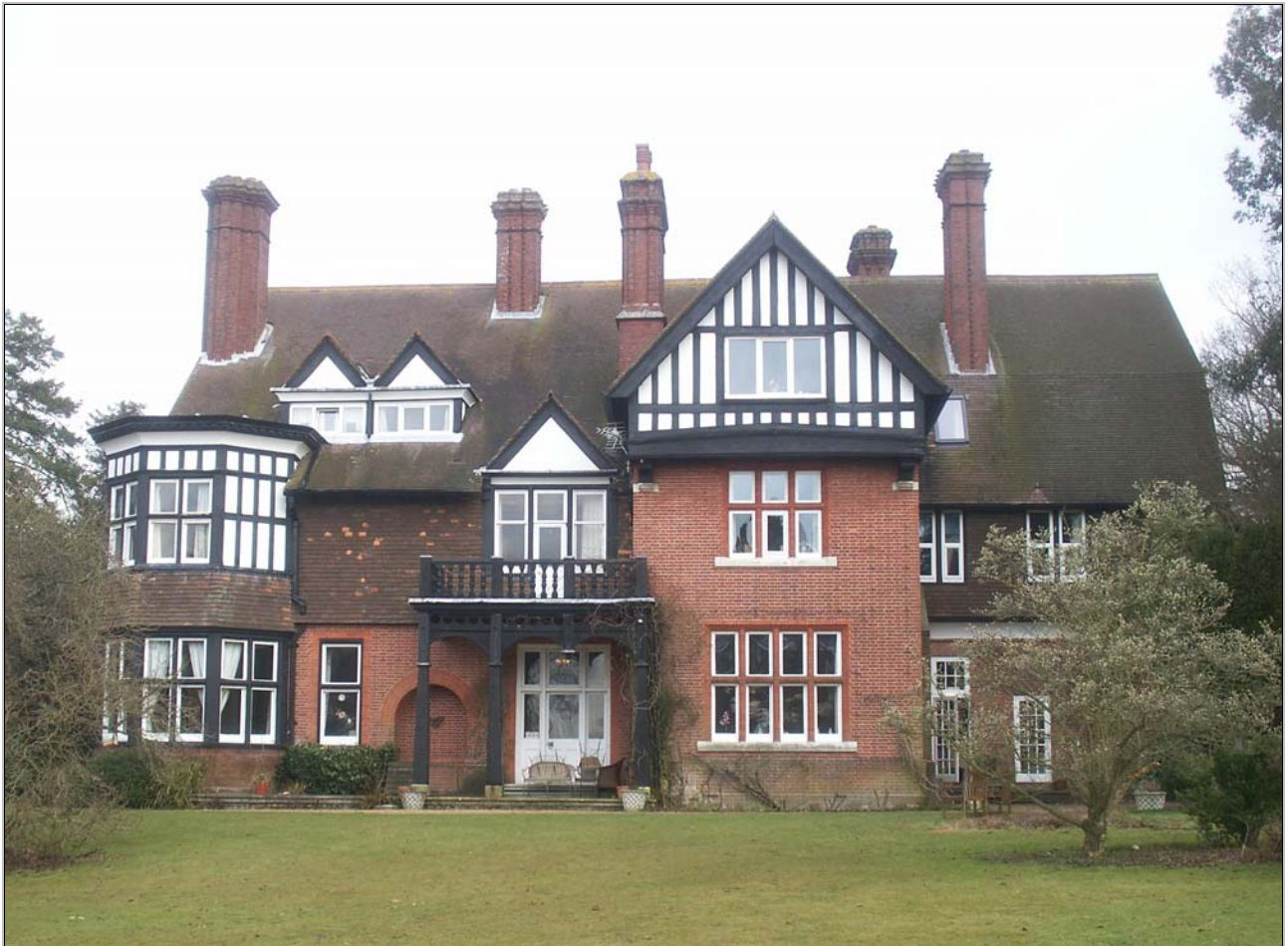
The Grange, Benenden