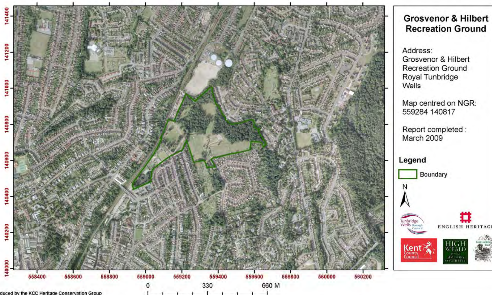
Fig. 4 Aerial photograph