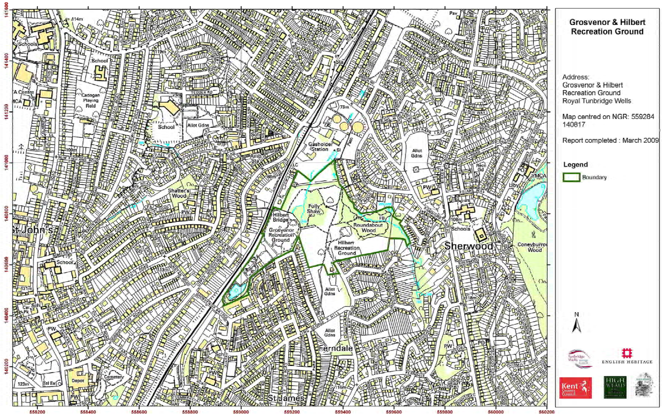
Fig. 1 Boundary map